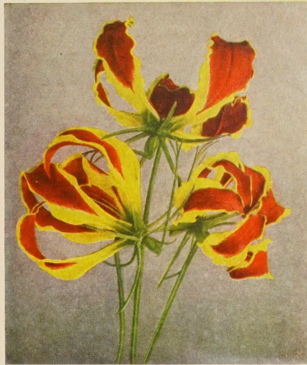
CLIMBING LILY "GLORIOSA", -3 for $2.75